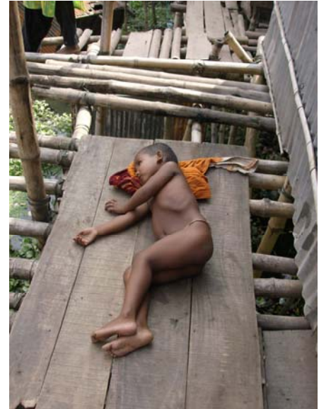
Figure 04: diarrhoea patient

Almost half of total 856 children are reported sick due to different types of water-borne diseases. 67% of affected children have been reported as suffering from diarrhea. The higher prevalence of disease among children reveals inadequate education or lack of consciousness among parents to give proper care to the children. Most of the time mothers are busy with household works; therefore children are not given enough care by them. Also unhealthy environment and mother's lack of knowledge about hygiene and dietary practice make children more vulnerable. Even though parents have some kind of primary education but lack of affordability to consume healthy food indicates poor dietary practice among children living in slums. It is said that nutritious food prevents chronic disease as it helps children to recover disease quickly like diarrhea. But majority of households can not afford healthy food items like protein food, not even in weekly basis.