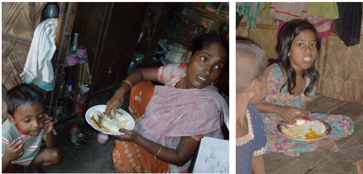
Figure 02: Lack of diversity in food item