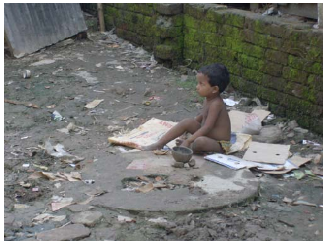
Figure 03: Scattered disposal of wastes

According to the households in study area, there is no fixed place for waste disposal. Generally wastes are disposed wherever they live like on the ground or above the water body. Therefore, scattered wastes are found visible in open place. It indicates that adequate facilities of waste disposal as well as collection are almost non-existent in slum area. From the sample data, it has been found that a large number of households (57%) dispose wastes into the water body, while 42% of households dispose on the ground, mainly on the street. Though, only 1% of households have been found to dispose wastes in dustbin. Exposure to such dirty environment is very risky for children as they spend most of their time playing outside.