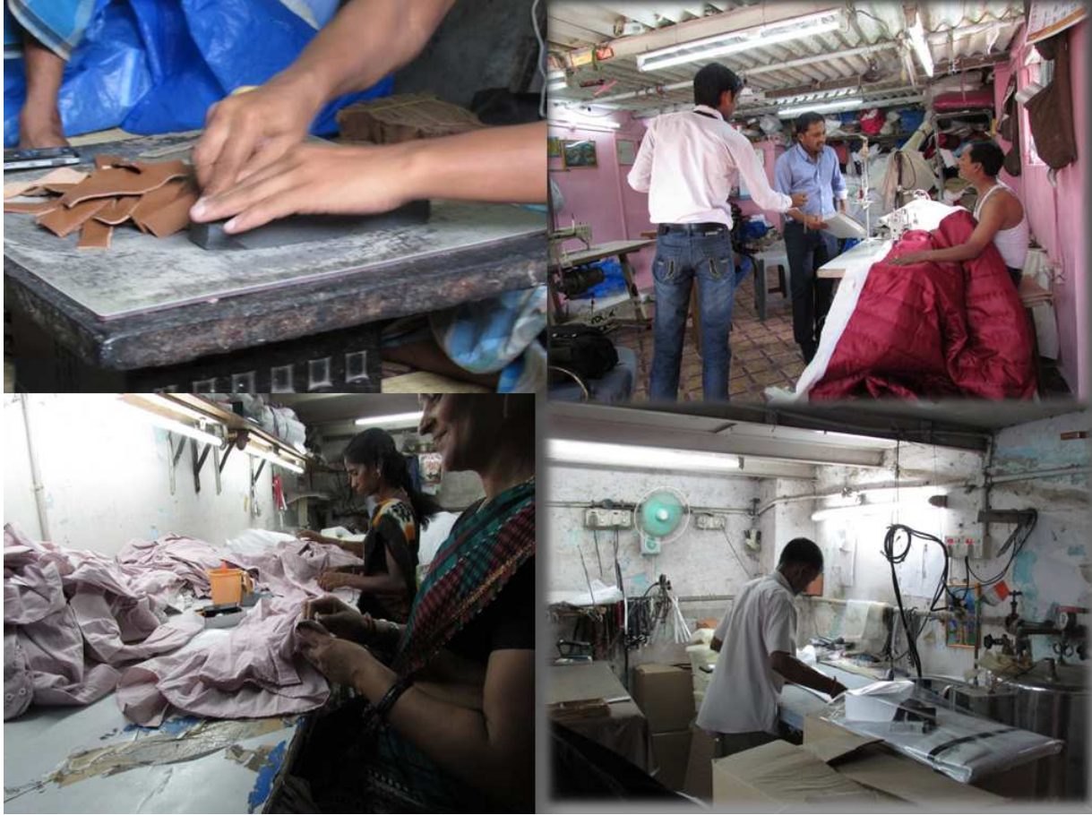
Course participants interacting with workers in Dharavi, Mumbai

The third lecture discussed technicalities of issues such as the sampling frame, sampling methods, and the sampling process. Time was dedicated to explaining most commonly used methods of sampling in the development sector such as simple random sampling, cluster sampling, convenience and purposive sampling techniques. Pros and cons of each method were then shared and the class given an opportunity to raise questions about the problems they faced in the field.