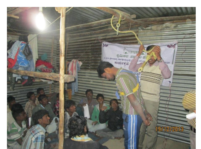
Figure 4: Health and Safety Measures Training at Labour Colony