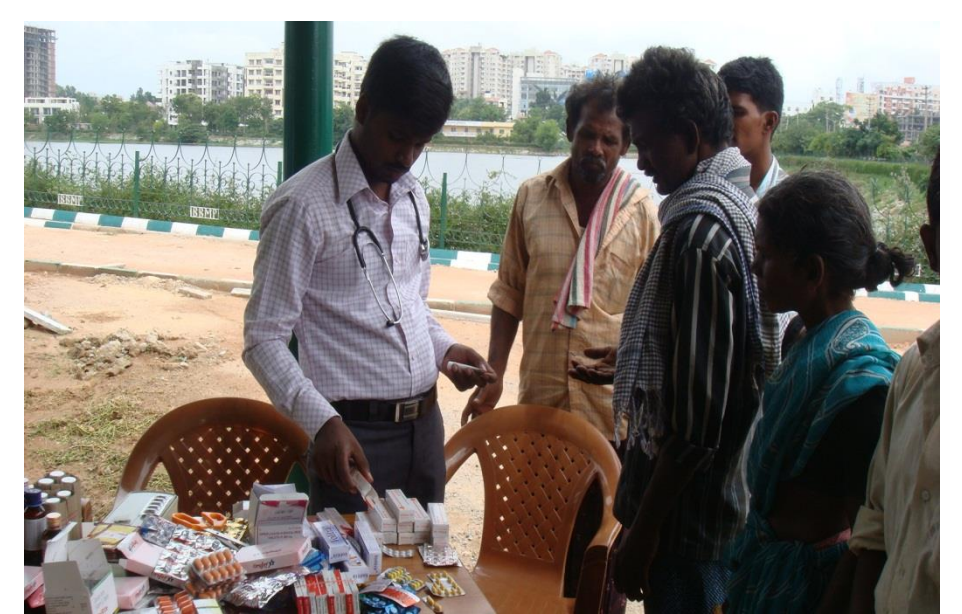
Figure 2: Health Camp for Workers