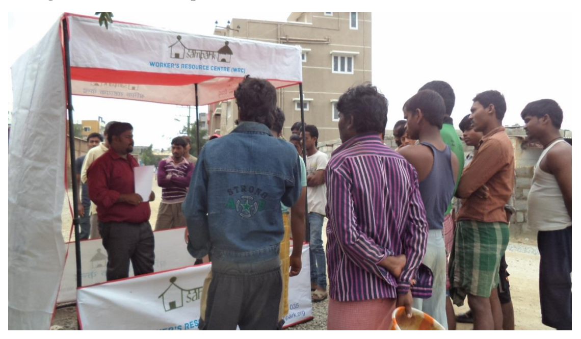
Figure 3: Labour Camp Outside Labour Colonies