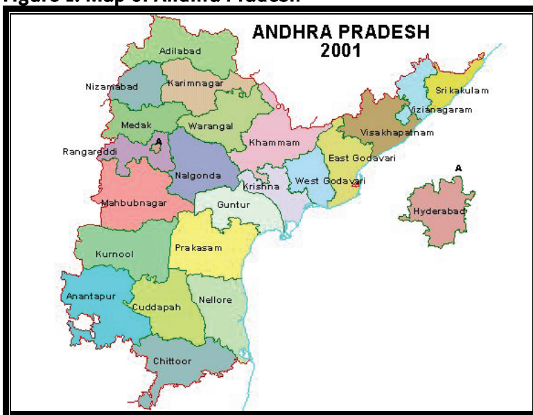
Figure 1: Map of Andhra Pradesh

AP is the poorest southern state but has a dynamic and growing information technology (IT) sector and receives a large flow of remittances from abroad, which fuel the economy. It is the fifth-largest state in India, both in terms of geographical area (276,814km 2 ) and population (76 million), comprising 23 districts, 1105 revenue mandals, 5 29,994 villages and 65,505 habitations. There is a great deal of diversity and disparity in terms of agro-ecology, irrigation, infrastructure and public and private investment. There are three broad regions which are culturally and historically distinct: Coastal Andhra, Telangana and Rayalaseema. 6